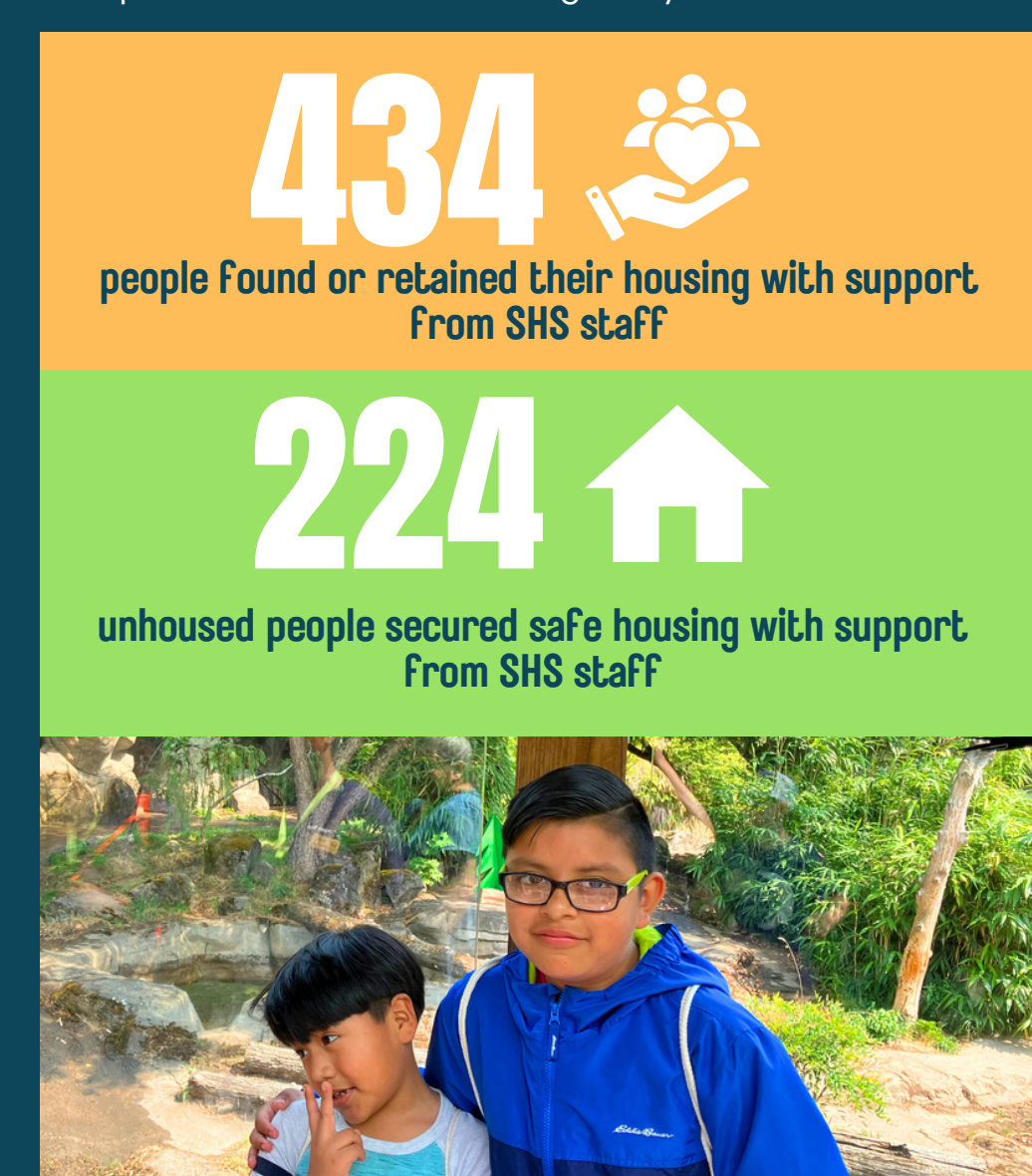
Resident youth at an Oregon Zoo field trip with Bienestar

Thanks to the hard work of SHS providers like Bienestar, Washington County announced in April that we have effectively eliminated homeless encampments in the County! While this is an important milestone, many households remain in temporary housing or are vulnerable to housing instability. We continue to work tirelessly to ensure households can maintain their housing and prevent them from re-entering the cycle of homelessness.